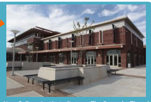
New College Institute

Development: The New College Institute, built a 52,000 square foot facility on the Baldwin Block in 2014, creating an education and technology hub. A block away, a developer is converting an empty hotel into a mixed use development.